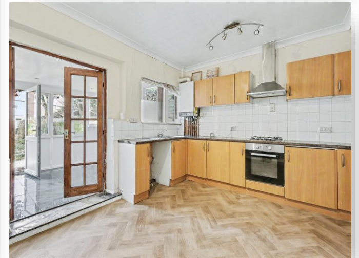
Murray Avenue, Northampton NN2 7BS