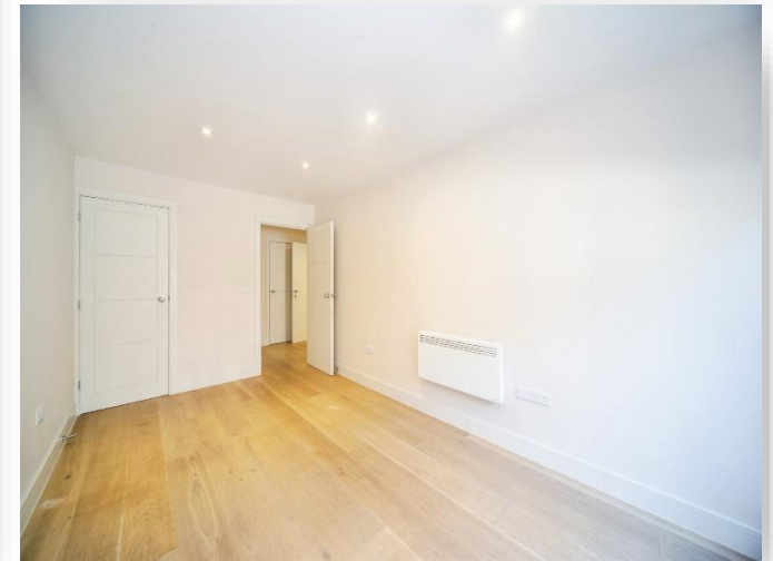
St. Clement Street, Winchester. SO23 9DR