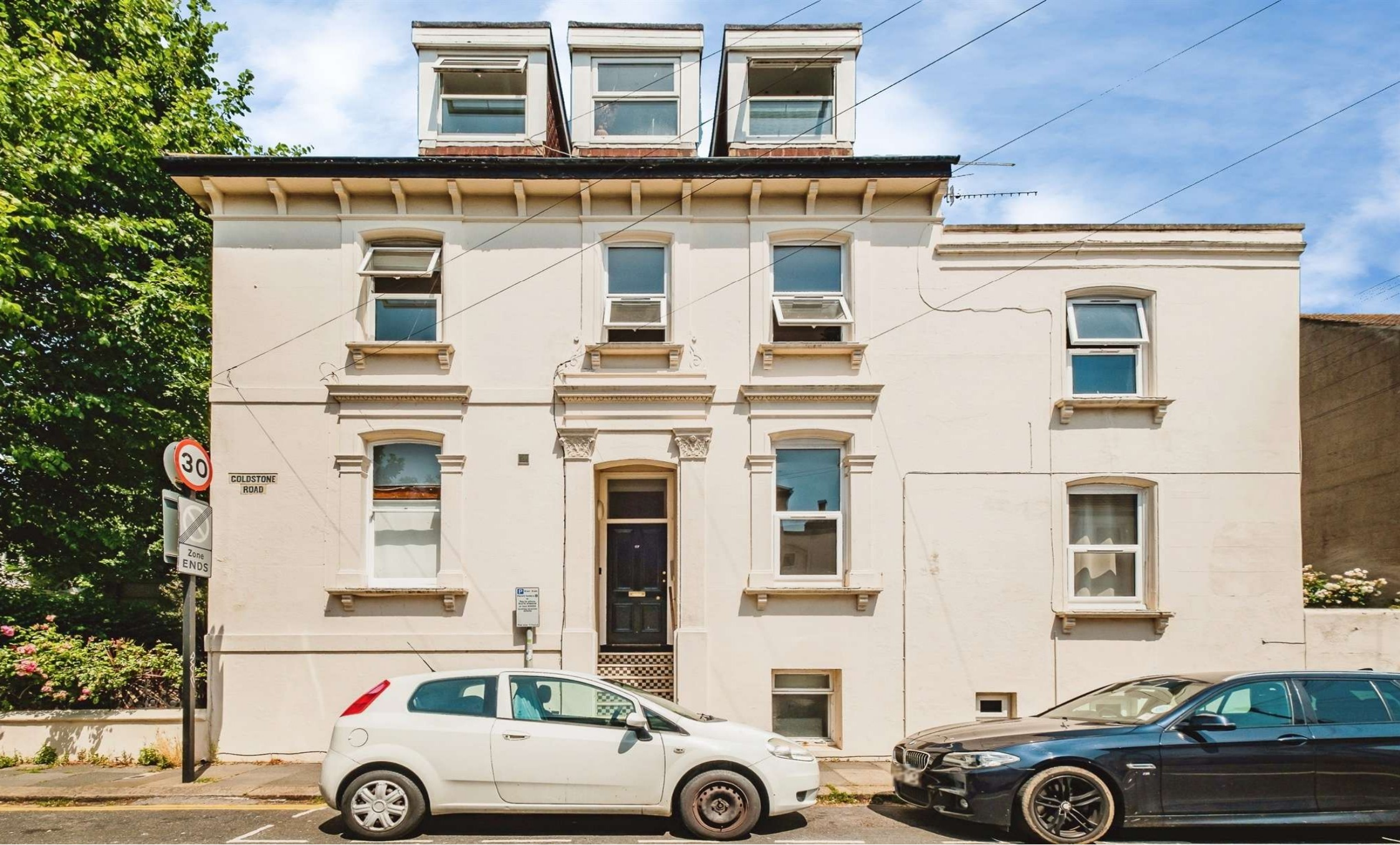
Sackville Road, Hove BN3 3WF