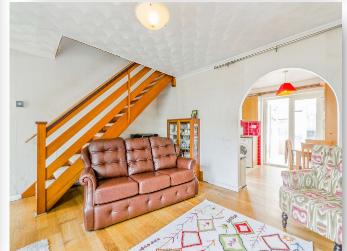
Vaindre Close, St. Mellons Cardiff CF3 0LJ