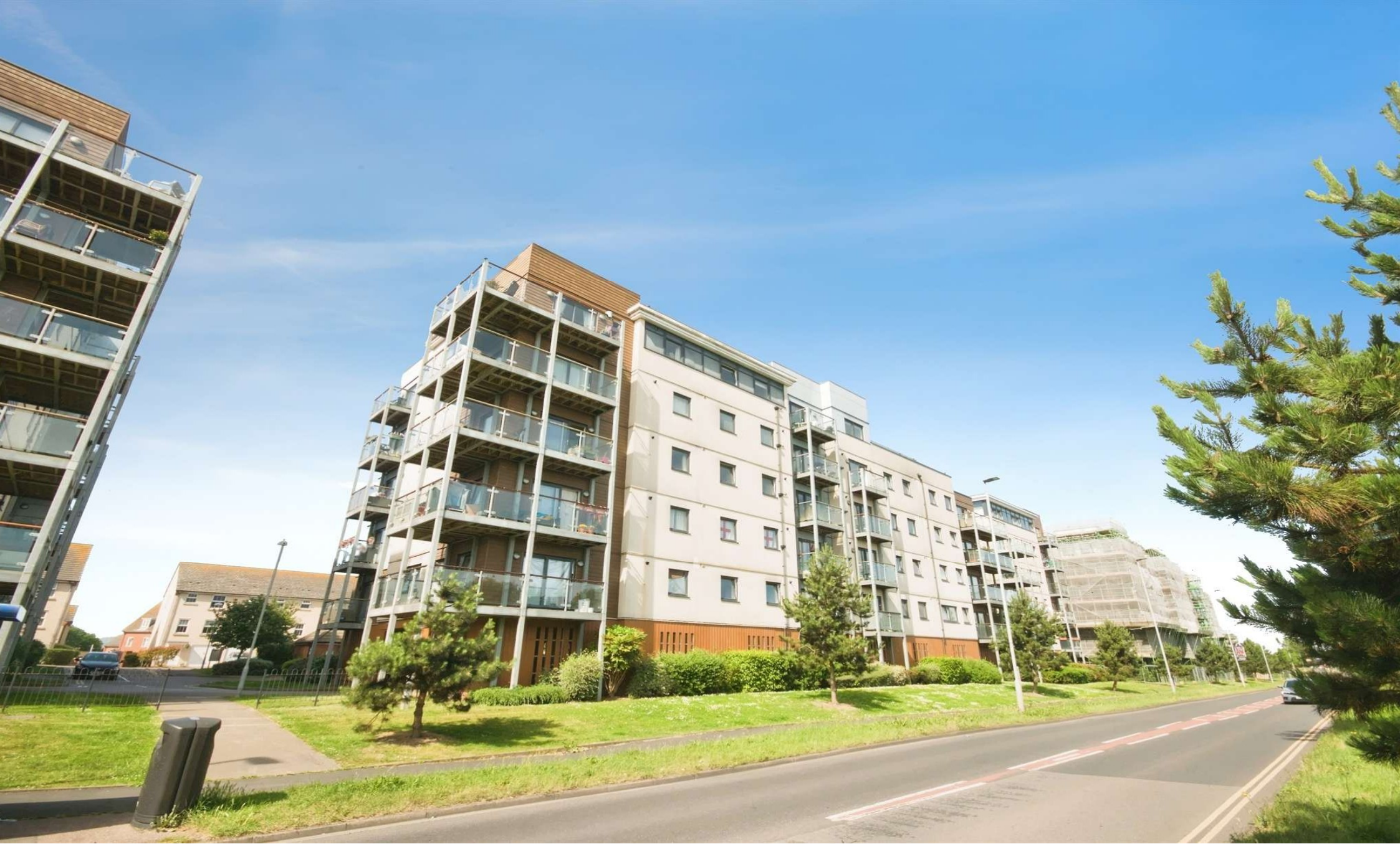
Standen House Groombridge Avenue, Eastbourne BN22 7FF