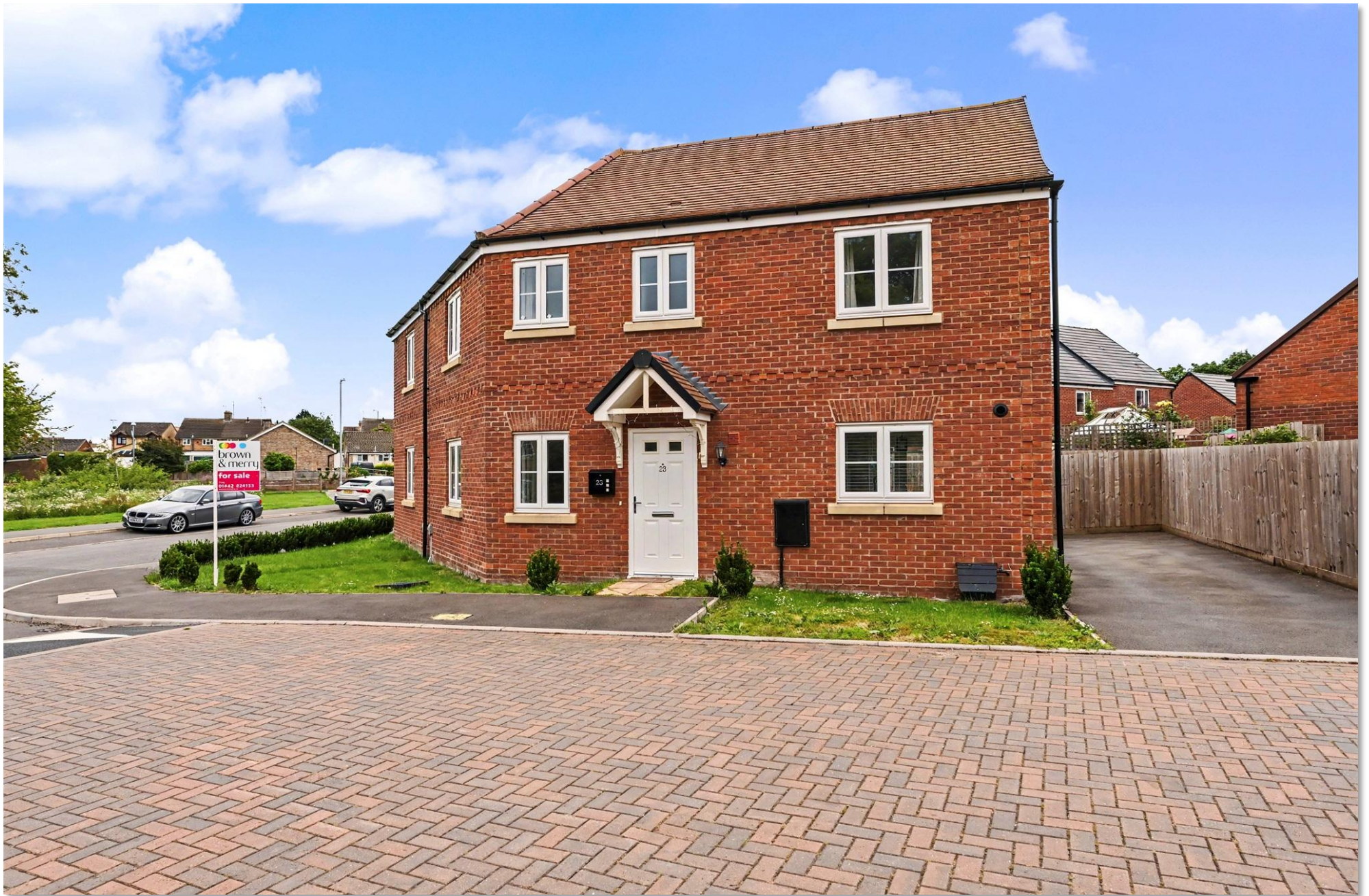
Ponies Close, Cheddington Leighton Buzzard LU7 0FY