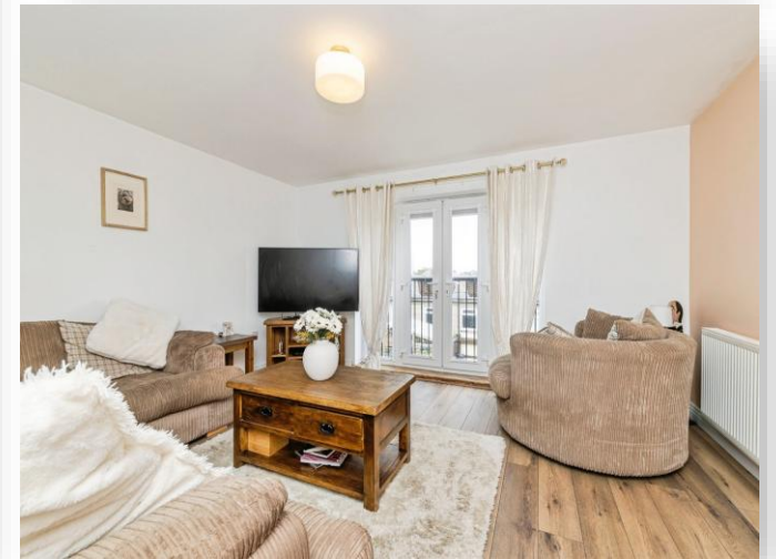
Charlton Close, BILLINGHAM TS23 4DG