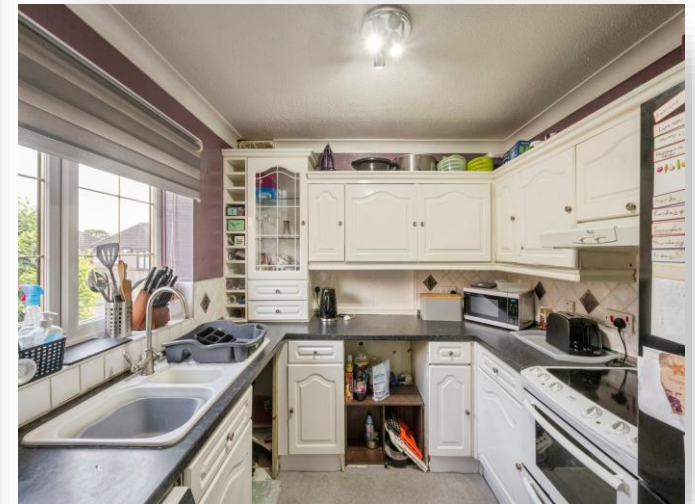
Windsor Close, Harlington Doncaster DN5 7JU