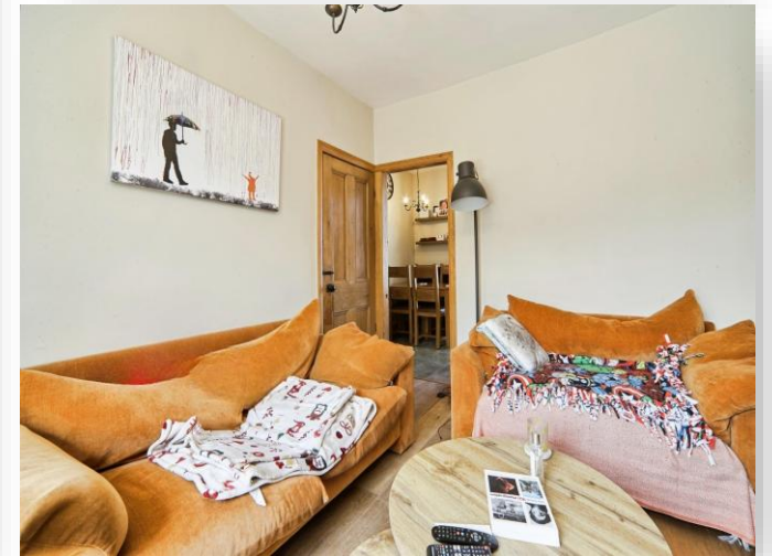
Dickinson Street, Horsforth Leeds LS18 5AG