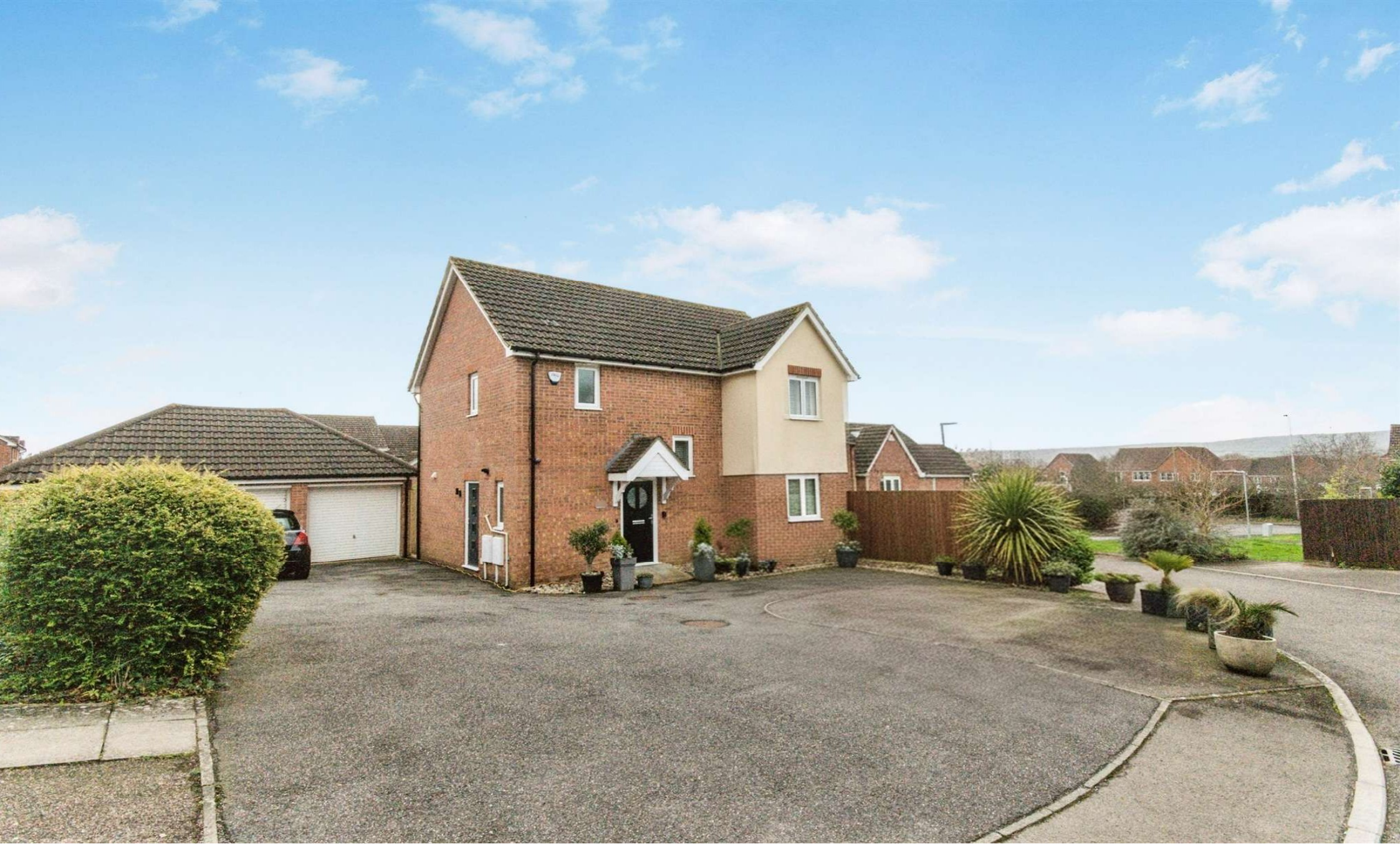
Pride View, Stone Cross Pevensey BN24 5GF