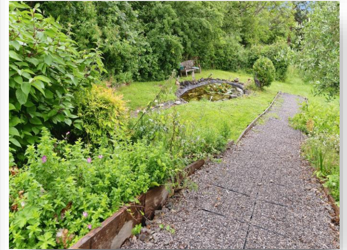
Daisy Farm, Newtown, Panborough, Wells, BA5 1PW