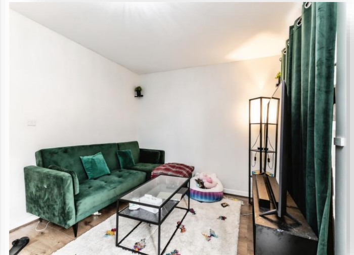
Orme Court, North Ormesby Middlesbrough TS3 6LT