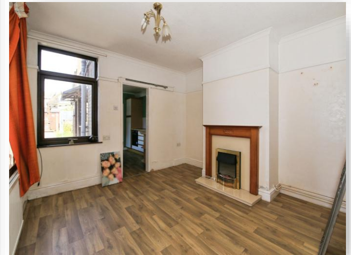
Chapel Street, Stanground Peterborough PE2 8JG