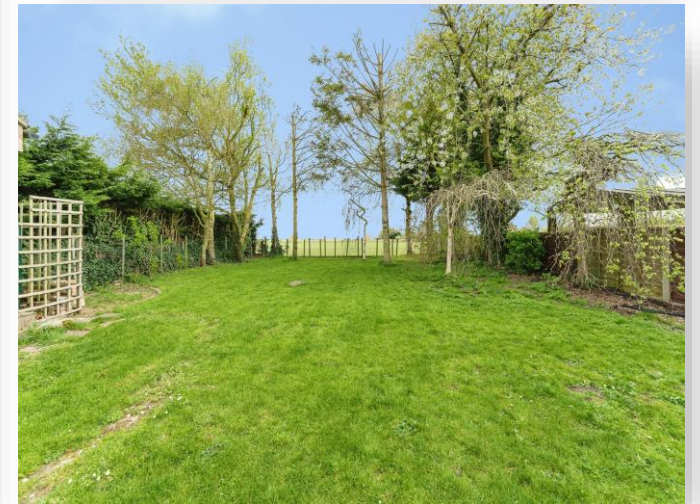
Church Road, Christchurch PE14 9PQ