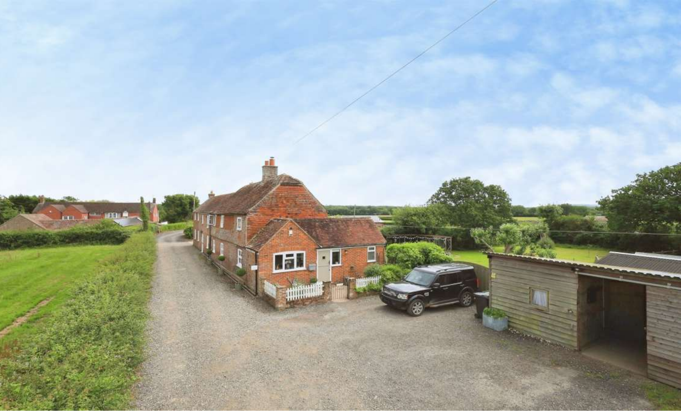
The Old Farmhouse, Chalvington Road, Golden Cross BN27 3ST