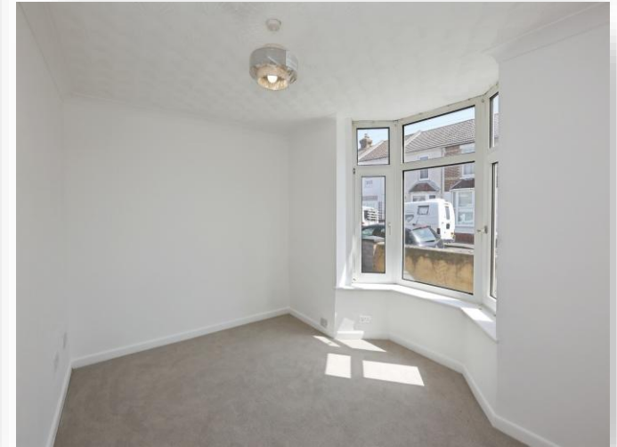
Woodstock Road, Gosport, PO12 1RS