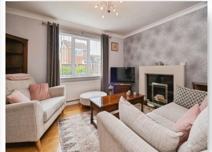
Saxonfield, Coulby Newham Middlesbrough TS8 0SN