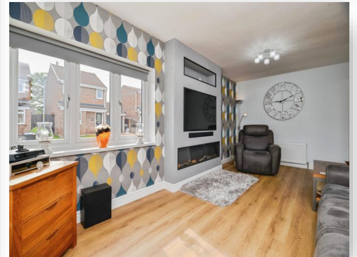
Fox Howe, Coulby Newham MIDDLESBROUGH TS8 0RU