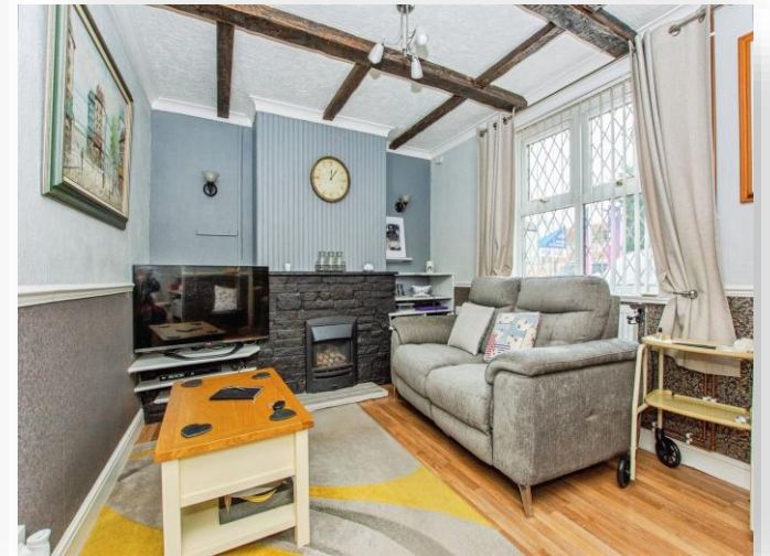
New Drove, Wisbech, PE13 2RZ