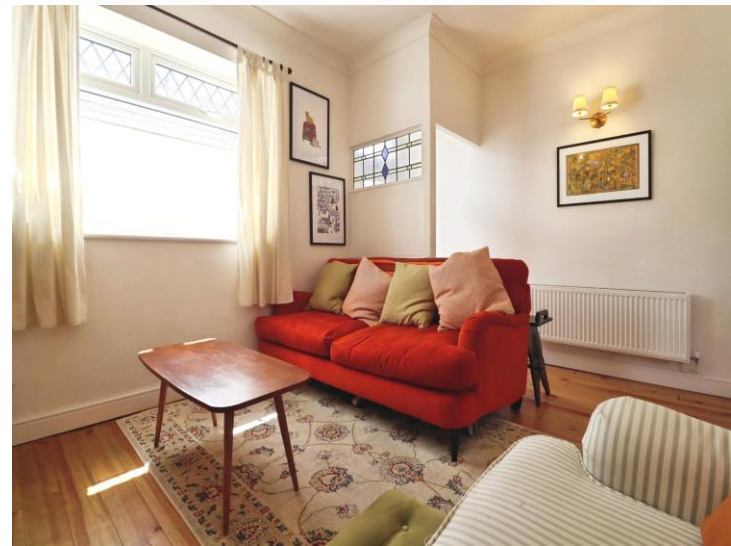
Ethel Street, CARDIFF CF5 1EN