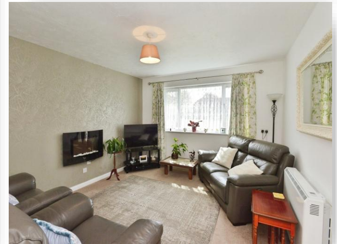
Ruskin Court, Newport Pagnell, MK16 0JL