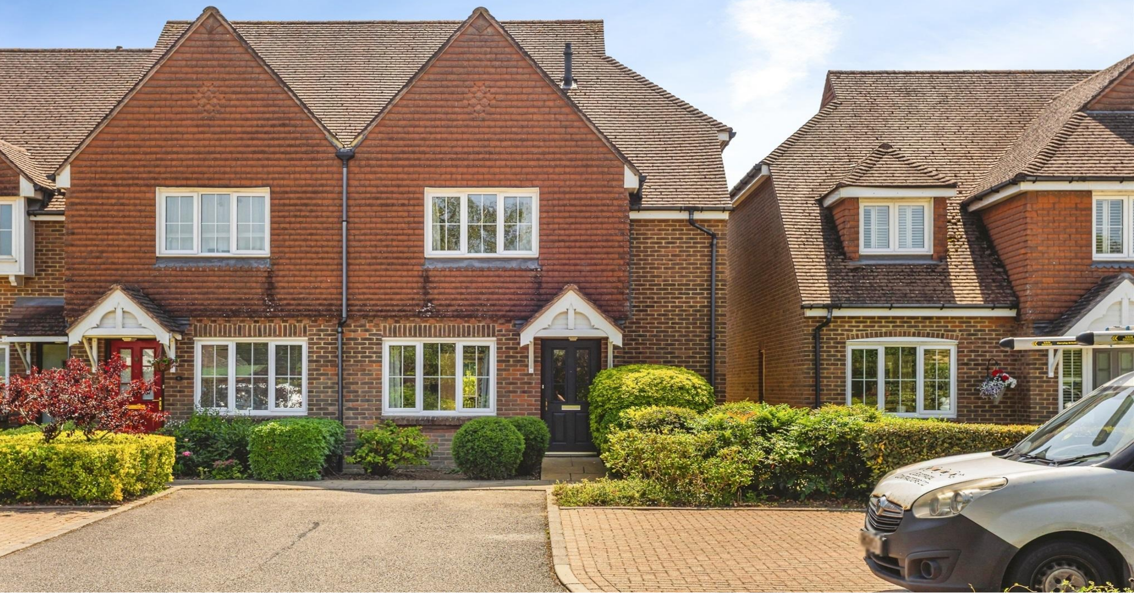
Osborn Close, Sayers Common, Hassocks BN6 9JR