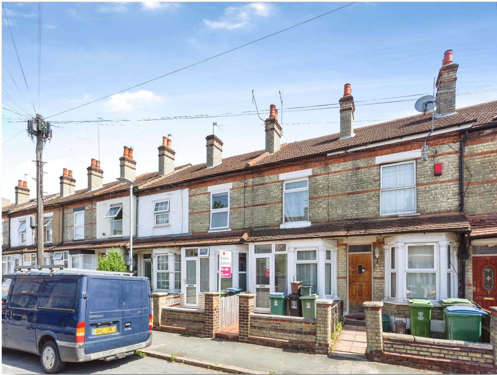
St. Marys Road, Watford, WD18 0EF