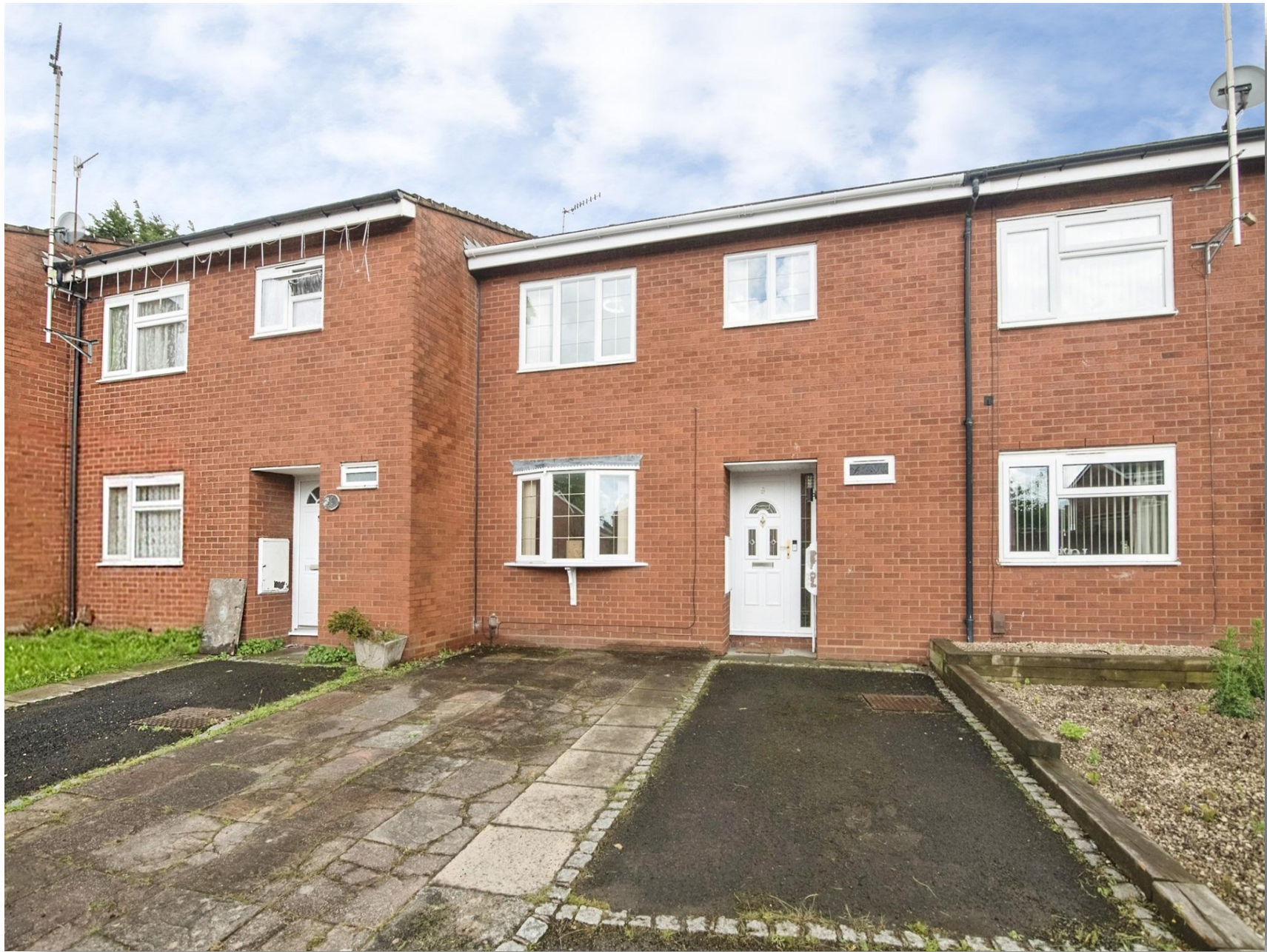
Ave Maria Close, CRADLEY HEATH B64 6HA