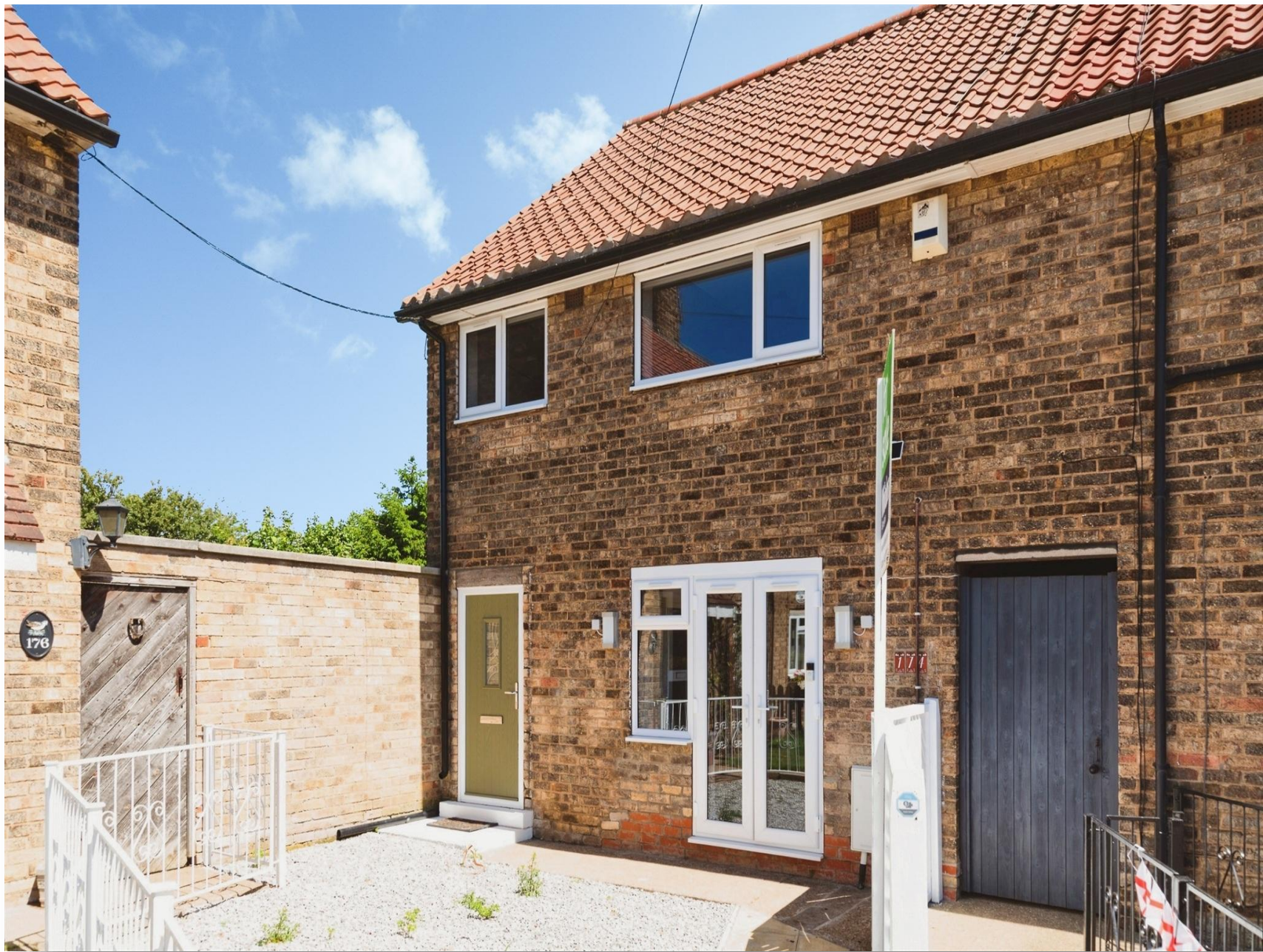
Wansbeck Road, Hull, HU8 9ST