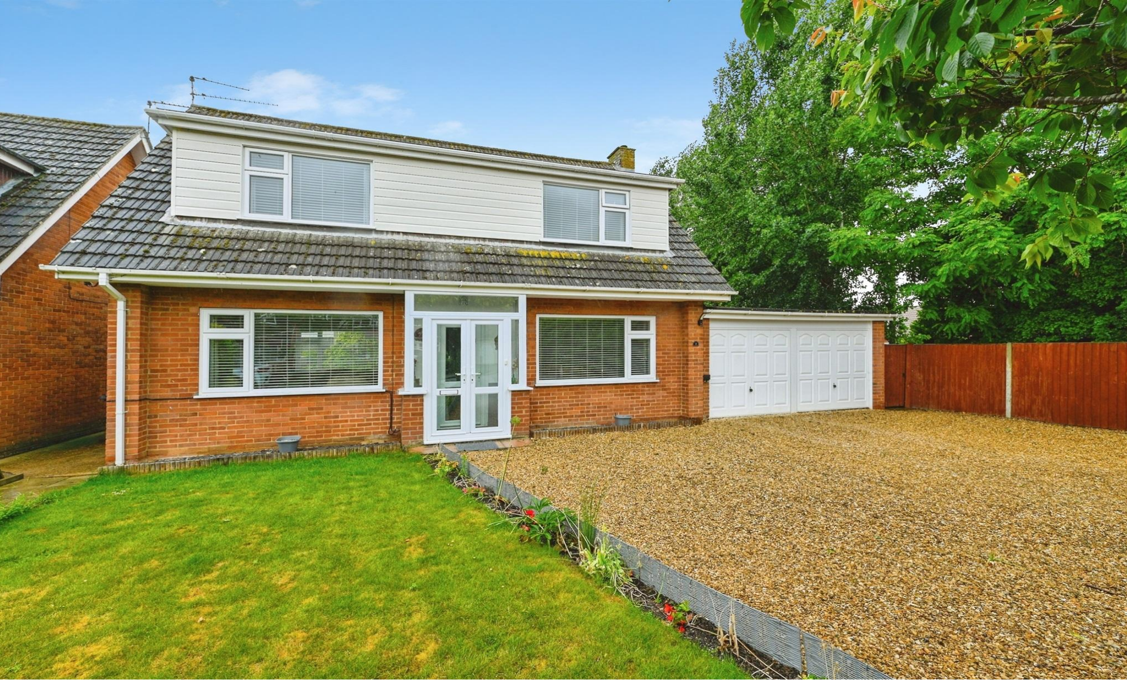
Walnut Avenue, West Winch, King's Lynn, PE33 0QE