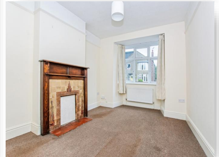
Station Drive, Wisbech PE13 2PP