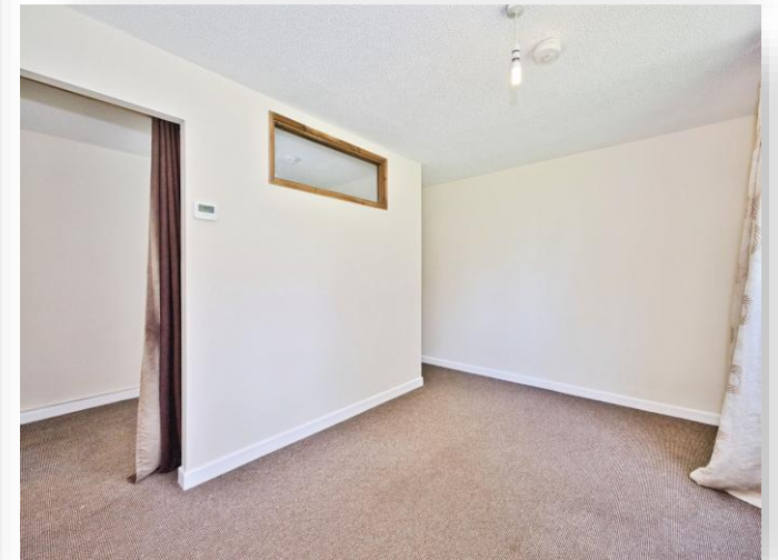
Bicknell Gardens, Yeovil, BA21 4LT