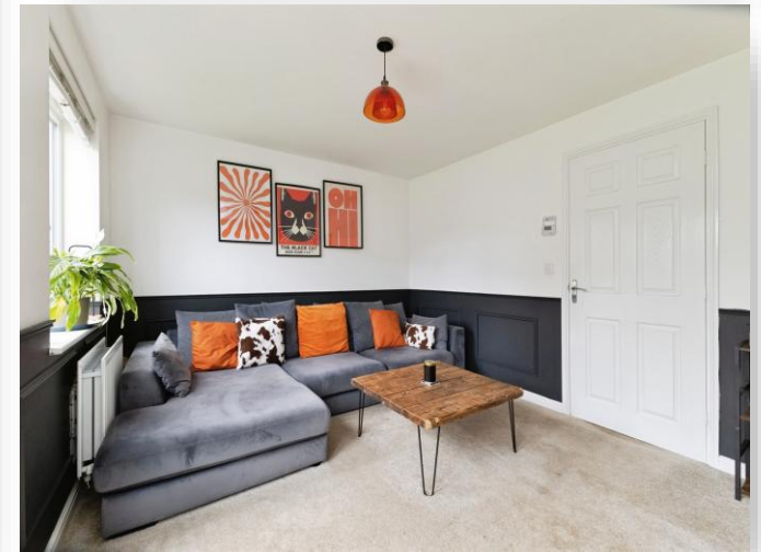
Mannion Way, Middlesbrough, TS4 2GW