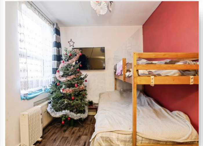
Edgbaston Road, Smethwick B66 4LF