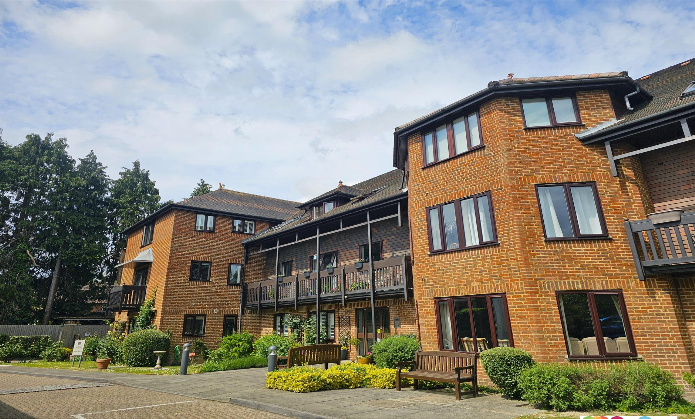
Bartholomew Court, South Street, Dorking RH4 2EN