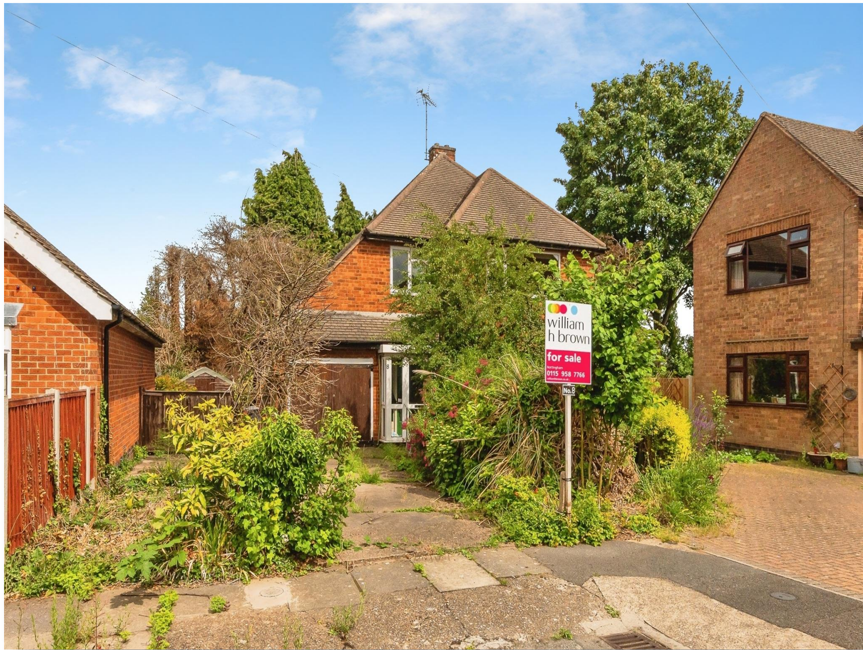
Norman Close, Beeston Nottingham NG9 4EW