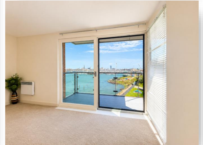
Harlequin Court, Rope Quays, Gosport, PO12 1EQ