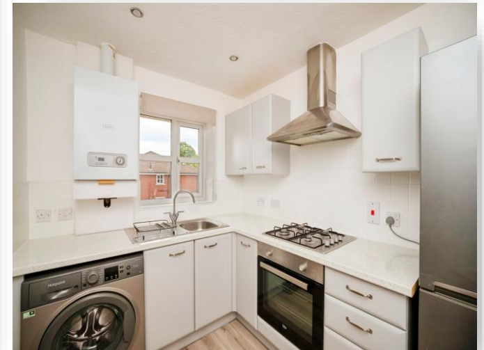
Ladybower Close, WIRRAL CH49 4RY