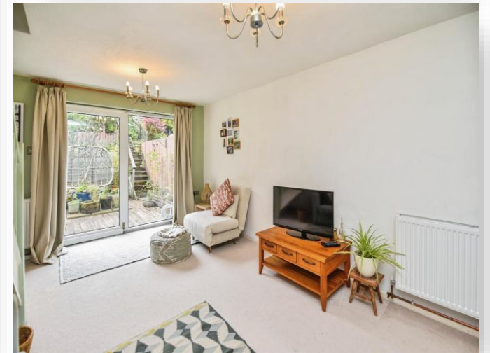
Upper Whatcombe, Frome, BA11 3SE