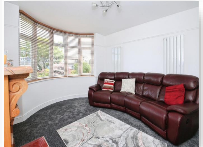
Peterborough Road, Farcet Peterborough PE7 3BH