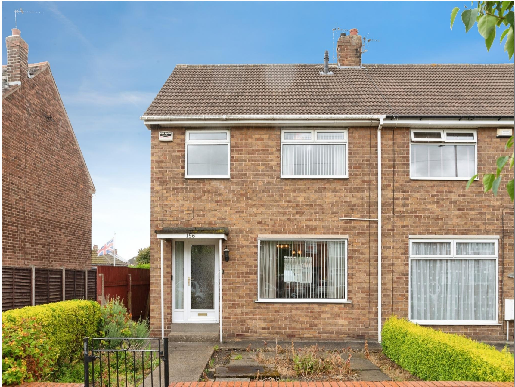
Lambwath Road, Hull, HU8 0HP