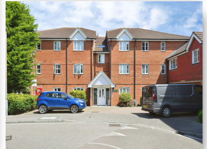
Winnipeg Way, Broxbourne EN10 6FG