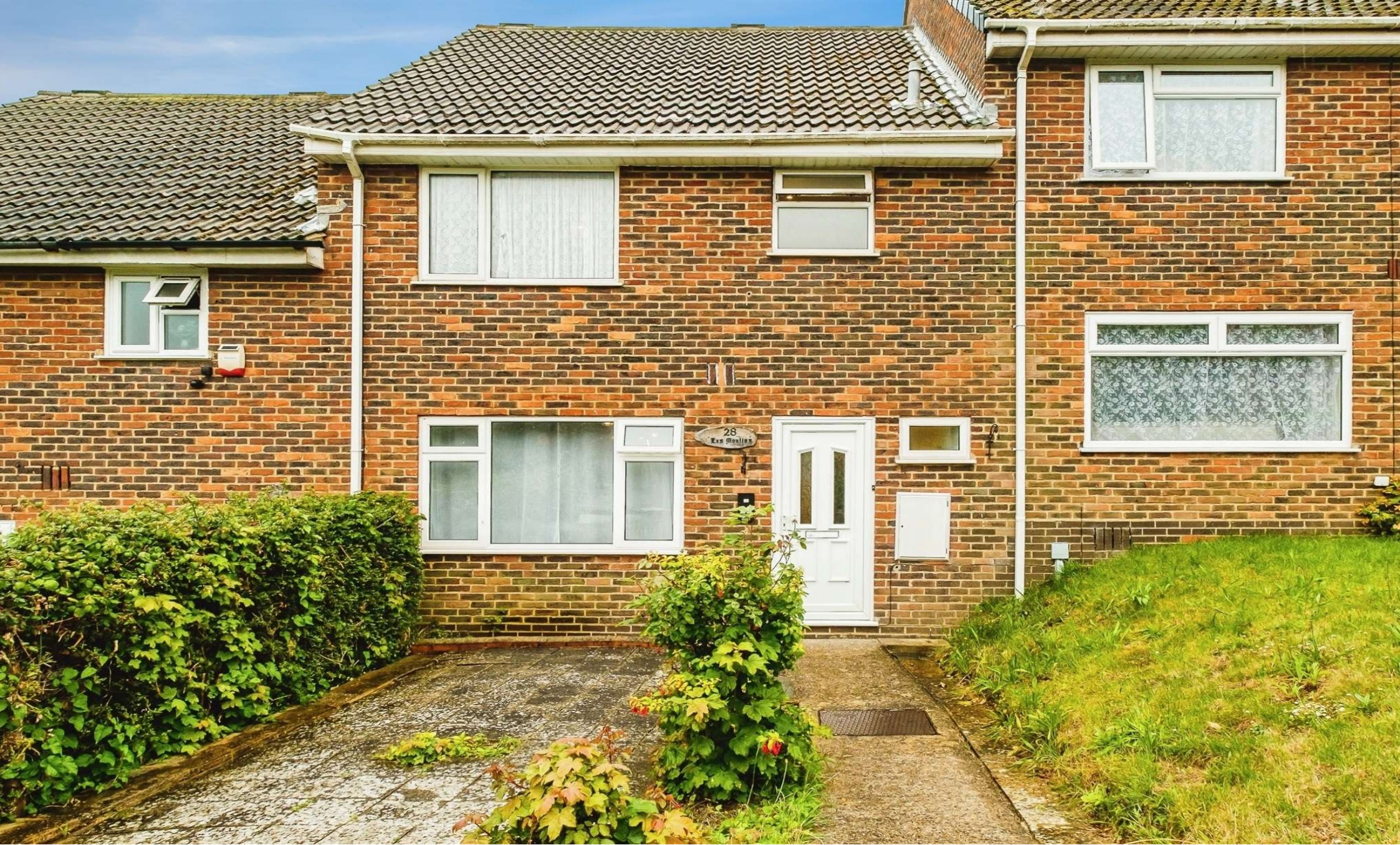
New Barn Close, Portslade Brighton BN41 2GQ