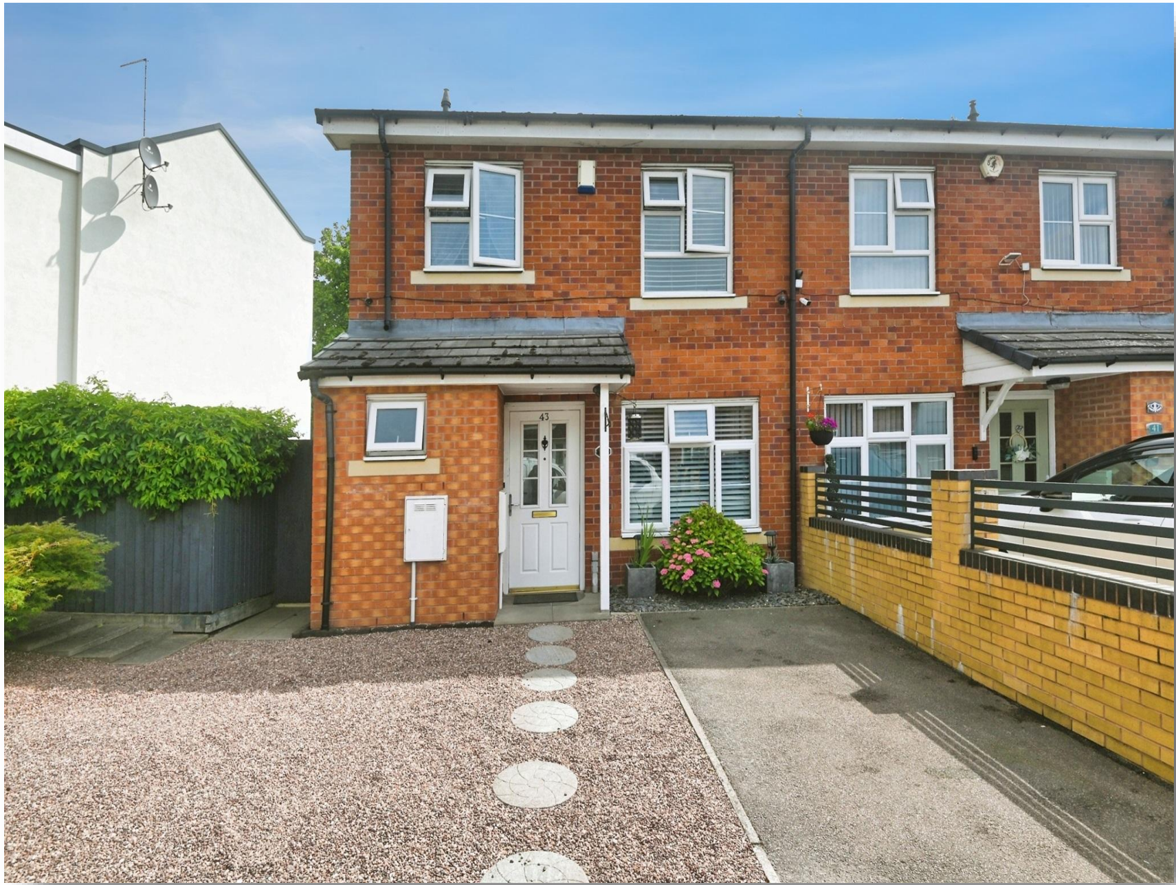
Berrowside Road, Birmingham B34 7LD