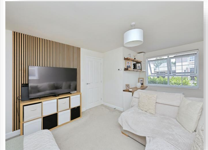
Metcalf Road, Rackheath, Norwich, NR13 6UE