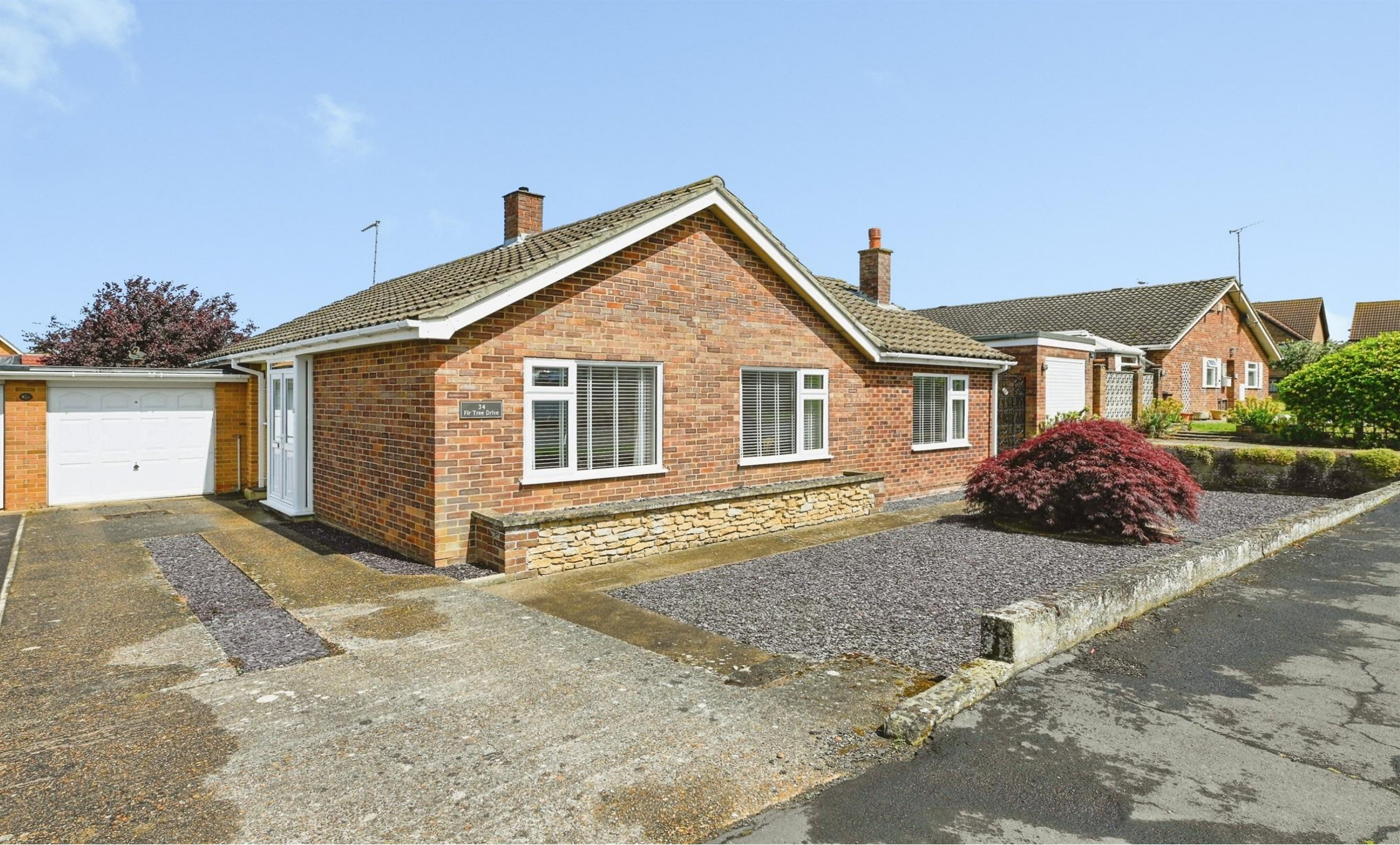
Fir Tree Drive, West Winch, King's Lynn, PE33 0PR