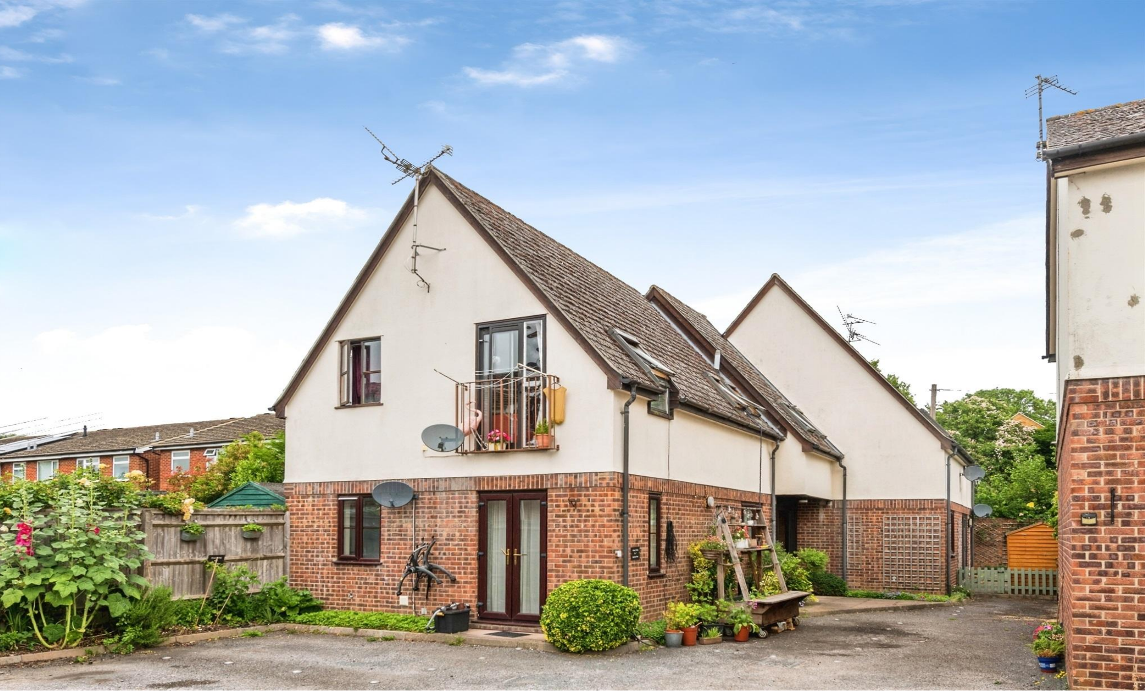
Buckland Mews, Abingdon, OX14 1ST