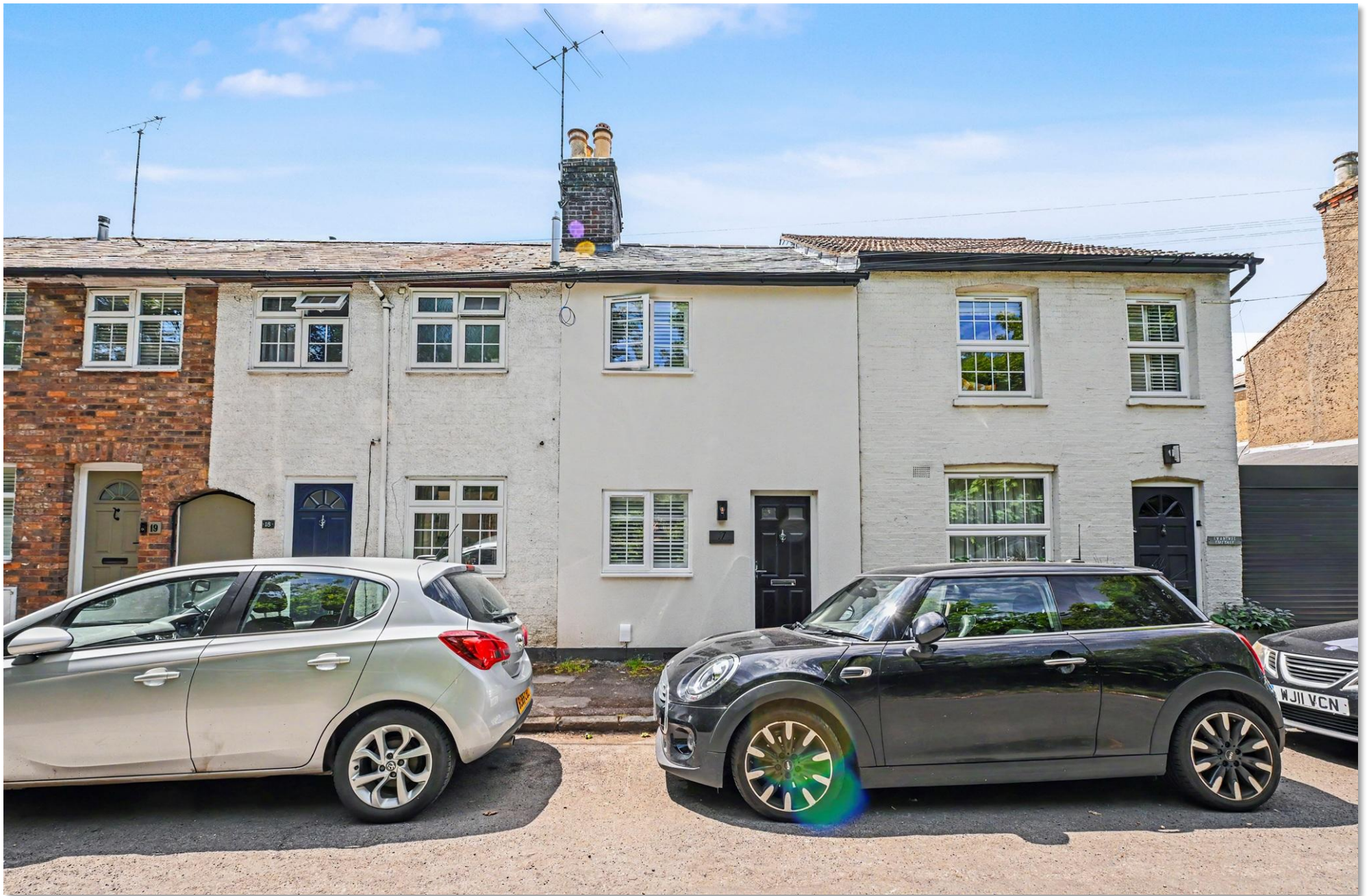
Ellesmere Road, Berkhamsted HP4 2EX