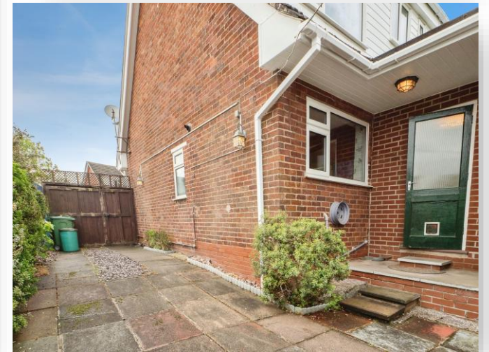
Conway Drive, Shepshed