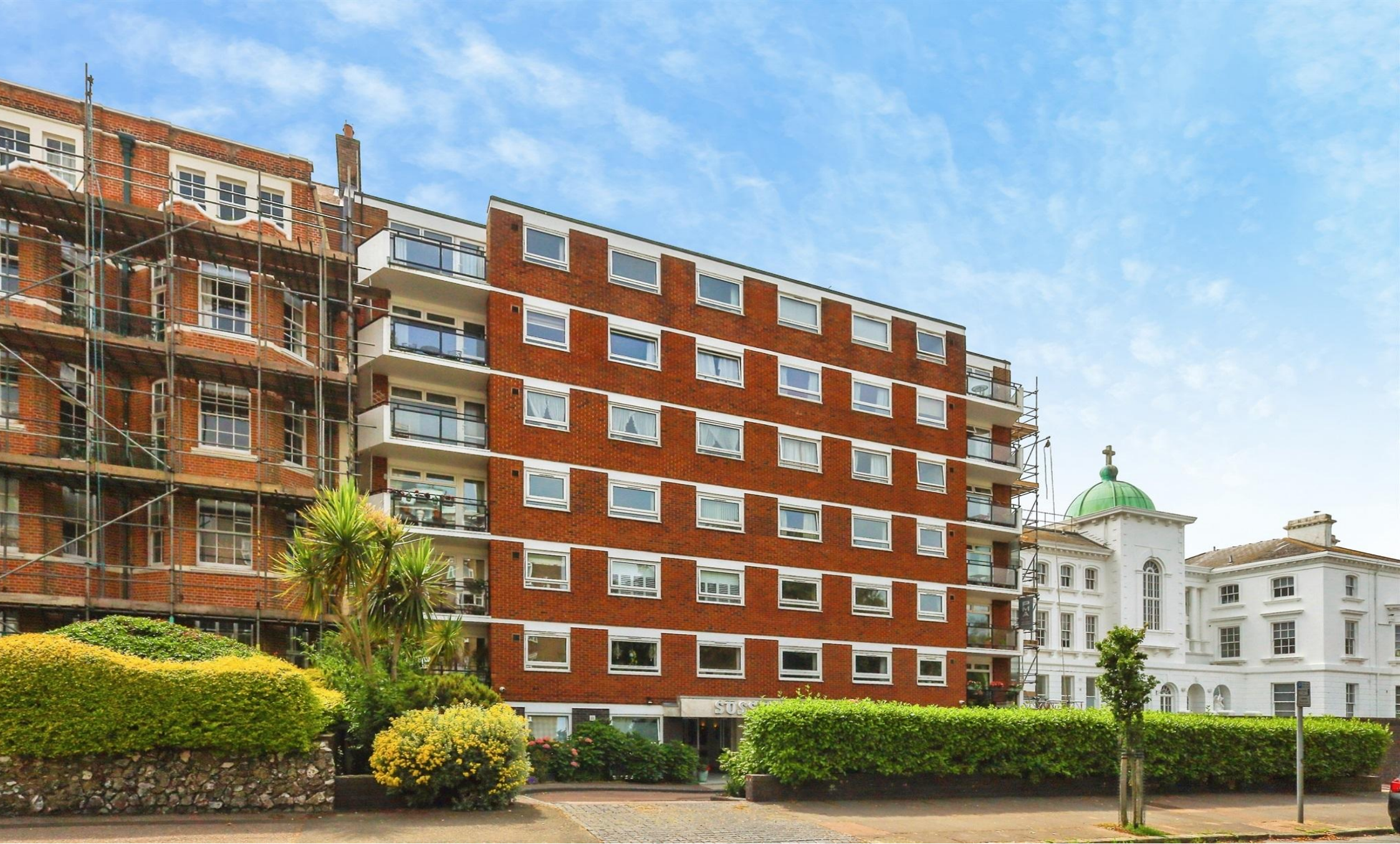
Sussex House Hartington Place, Eastbourne BN21 3BH