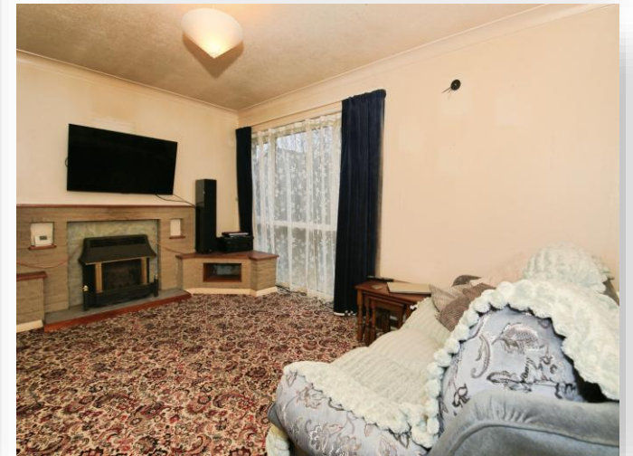
Walcot Walk, Peterborough PE3 9QE