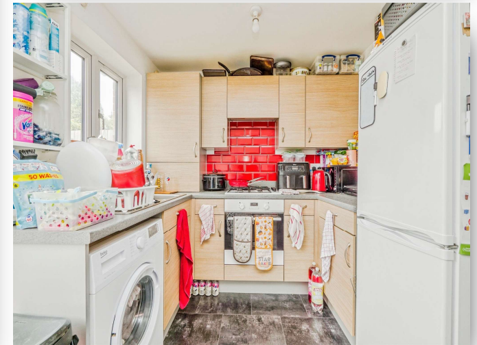
Boyce Way, Old St. Mellons Cardiff CF3 6AB