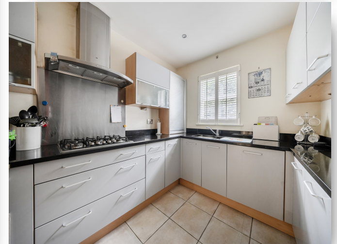
2 Taplow Quays, River Road, Taplow, Maidenhead SL6 0AB