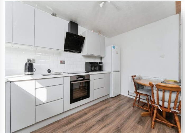
Kingsmead Court, Littleport CB6 1LR